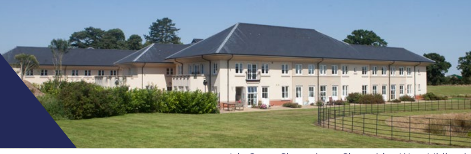
Isle Court, Shrewsbury, Shropshire, West Midlands